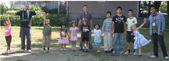
Leaders and children enjoy the beautiful weather outdoors.