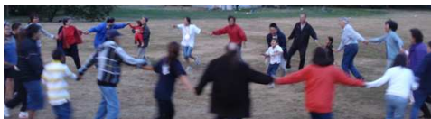
A circle dance after the evening rally.