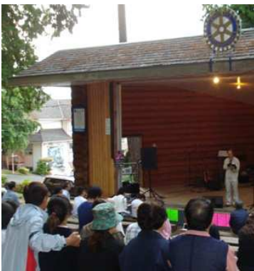
Rally at Water Wheel Park in Chemainus