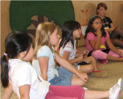
Rapt attention to the Bible lesson.