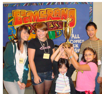
Smiling winners of the "Run for Jesus" contest.