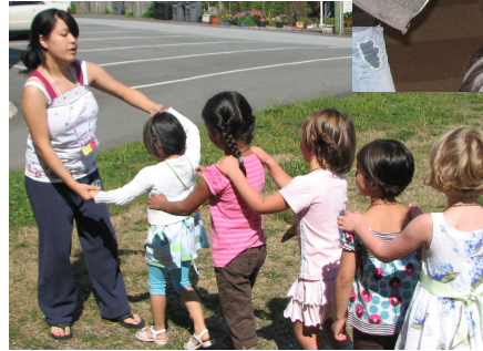
Playing the "Train" game.