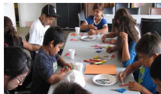
Making crafts in VBS.